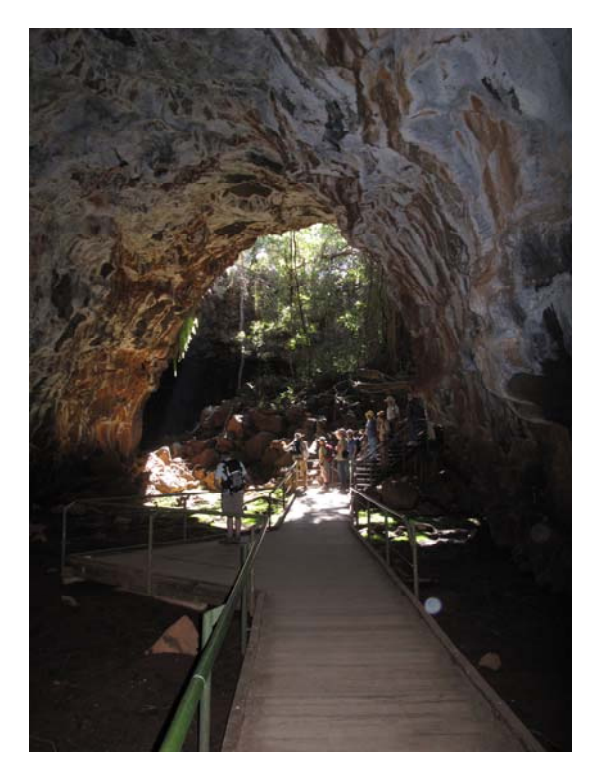
Lava tube, Undara.

We had nearly completed the sampling when Lana started detecting lower oxygen levels (17.5%) which necessitated a rapid retreat. This trip would not have been possible without Lana having established an occupational health and safety protocol for access to the cave. This visit to Bayliss Cave was perhaps the highlight for me, however, it is the large size of the tunnels at Undara which remain in the mind long after the visit.